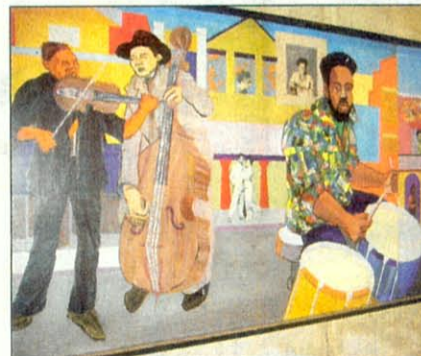
The U Street Mural celebrates the area's intellectual and musical heritage

You can find perfectly prepared pu'er or rare Royal Himalayan snowflake brews at the new Tea Cellar at the Park Hyatt Hotel (24th at M Street; www.parkhyattwashington.com ). The hotel reopened recently after a redesign by Tony Chi (Spoon at the InterContinental, Tsim Sha Tsui; the Park Hyatt Tokyo). With the guidance of a sommelier, tea lovers can sample a 1949 cave-aged pu'er at US$90 a pot, or a pot of US$300 1985 Royal Reserve.