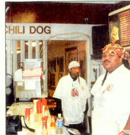
The Chili Bowl, on U Street, is just the place to enjoy a chilli half-smoke to the sound of classic rhythm and blues

There's more to do than soak up establishment venues such as the Willard Hotel (where lobbying was reputedly